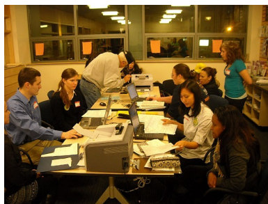
PHOTO OF THE QUARTER-VITA

If exempt organizations have gross receipts greater than $25,000 but less than $500,000, and total assets of less than $1.25 million, they may qualify to file Form 990-EZ, Short Form Return of Organization Exempt from Income Tax. However, the thresholds decrease for tax year 2010, making it substantially more difficult to qualify. For 2010 and future years, only organizations with gross receipts greater than $50,000 and less than $200,000, and total assets of less than $500,000 may file Form 990-EZ.